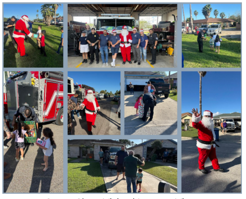
Santa Claus Visited Laguna Vista with the help of our finest

As always, your Town Council is here to serve you. Please feel free to reach out via email with any questions, suggestions, or input. Together, let's make 2025 a fantastic year for Laguna Vista!